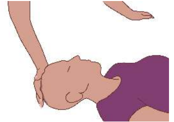
7th chakra - top of the head