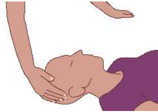
6th chakra - center of the head Avoid covering ears Do not clear on the forehead - way too many chakras there!