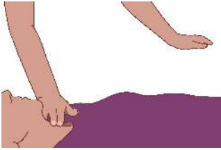
5th Chakra & Detail to right Only two fingers lightly touching Adam's Apple.