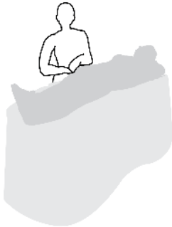
Illustration: Clearing the Etheric Aura